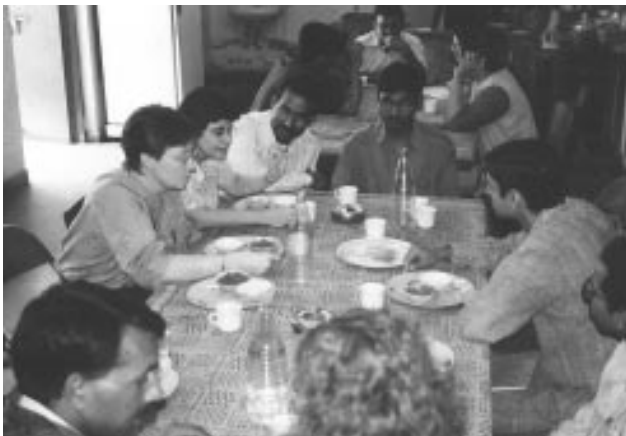
Informal discussion with JNU faculty and graduate students.