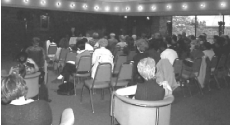
Irene Tinker's talk was attended by University of Illinois faculty and students

and safety and increase income in many countries around the world and influenced FAO policies; the FAO now trains street foods vendors rather than aiding governments to abolish them. The vendors also formed organizations in many countries.